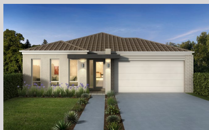
Modern Facade Option —