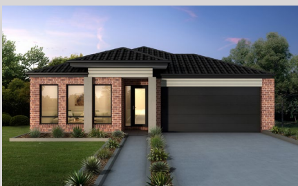
Contemporary Facade Option —