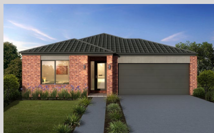
Classic Facade Option —