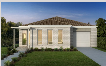
Classic Facade Option —