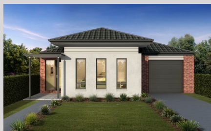
Contemporary Facade Option —