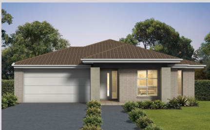
Amethyst Facade Option —