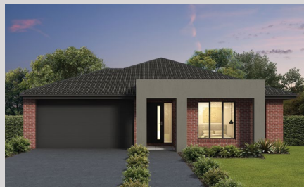
Amber Facade Option —